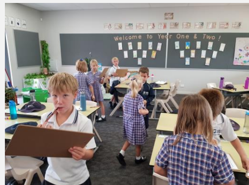
Learning about our new friends 😊

If you have any of these items lying around at home, it would be very much appreciated if your child could bring them in on Thursdays or Fridays. Many thanks in advance!